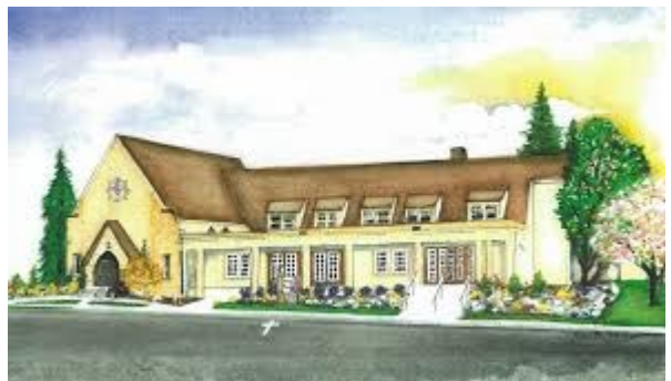
2013 painting by Beth Ann White