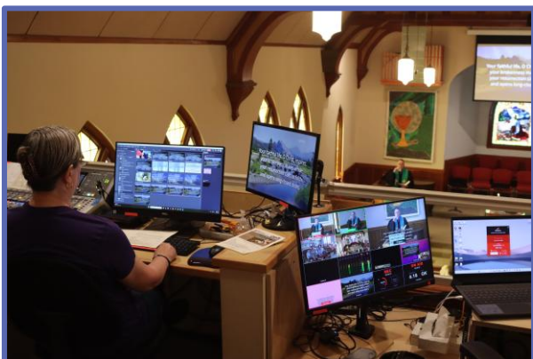
The media team in action