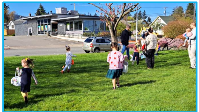
Perfect blue skies for the Easter egg hunt