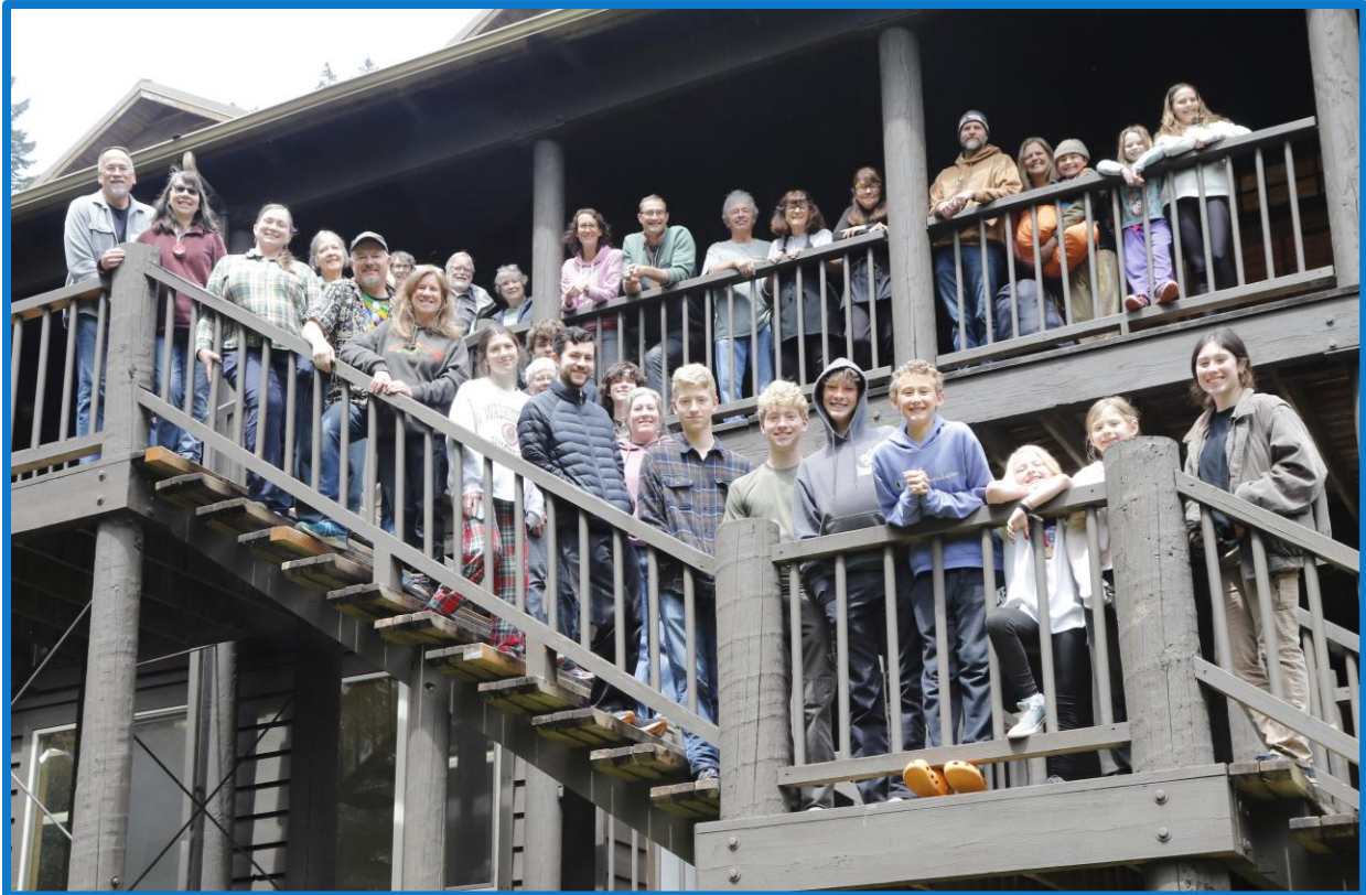
Camp David Retreat 2025

First Presbyterian Church 139 W 8 th St. Port Angeles, WA 98362 360-452-4781 fpcpa.org