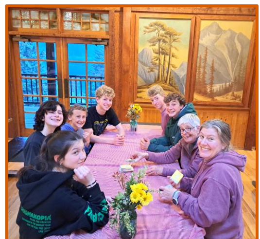
Camp David Retreat