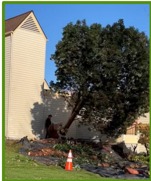
Felling the madrone tree