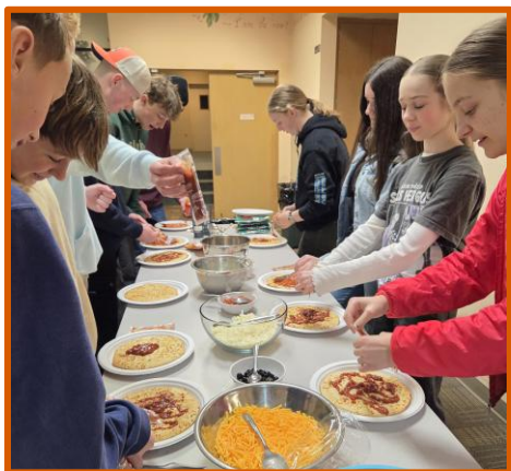
Youth Pizza Party

Spring: A pizza and game night at HTL, a movie night at B&B Lavender Farm, and a successful Easter egg hunt where our