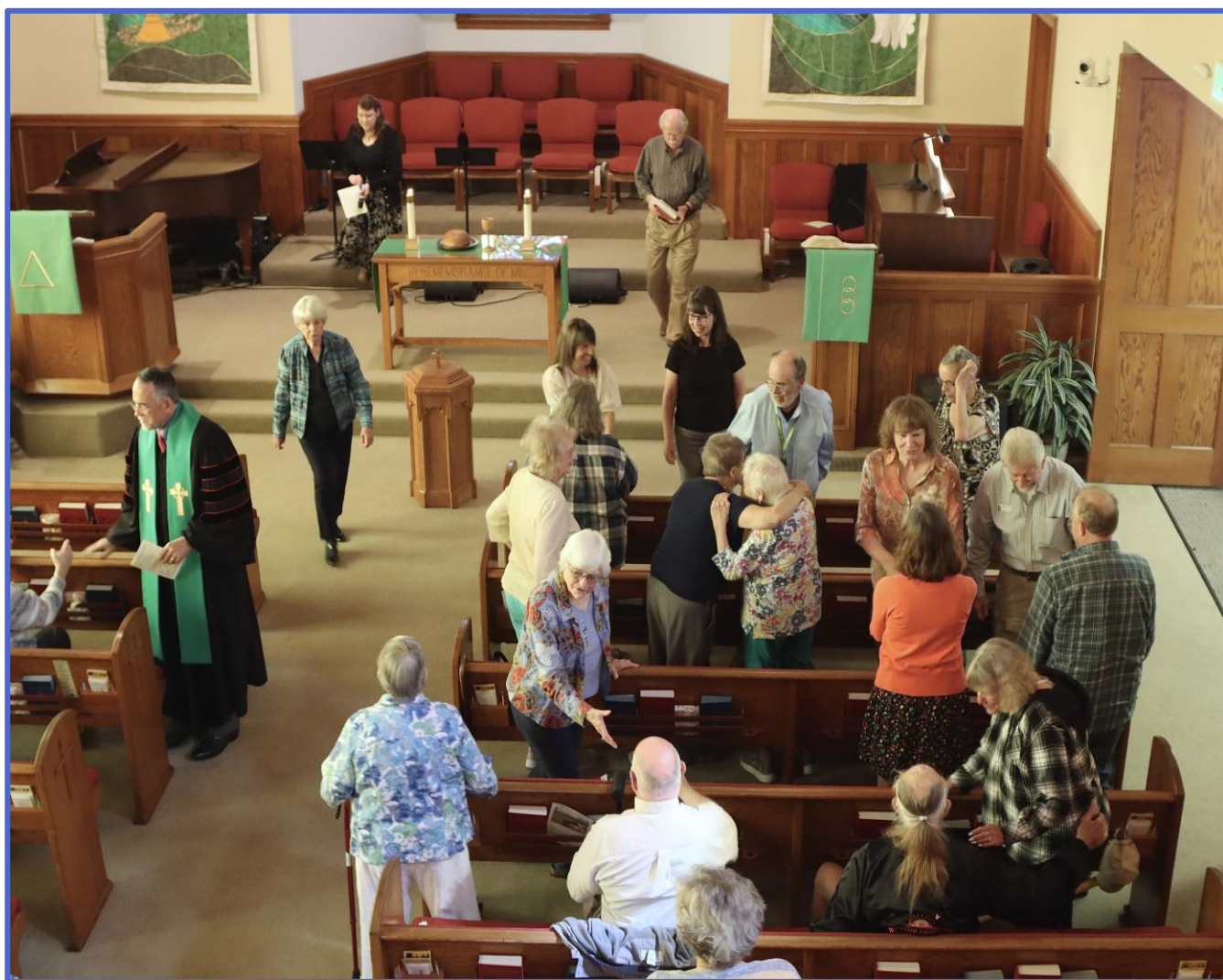
The congregation sharing the peace of Christ during worship