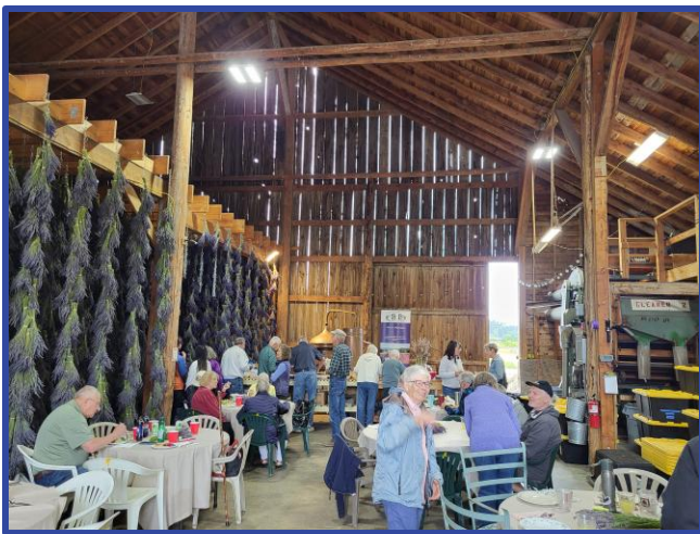
Potluck at B&B Lavender Farm