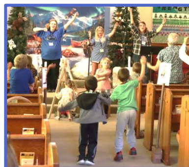
Singing and dancing at VBS

we transformed the church into an Alaskan forest with over 20 artificial trees. Participants enjoyed science experiments, team-building games, Bible-themed music and dance, skits, and themed snacks.